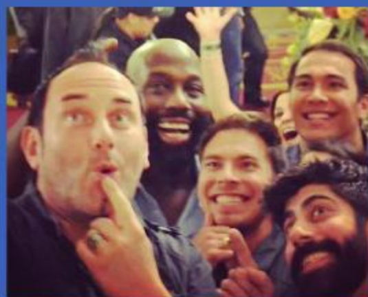
Comics take a selfie